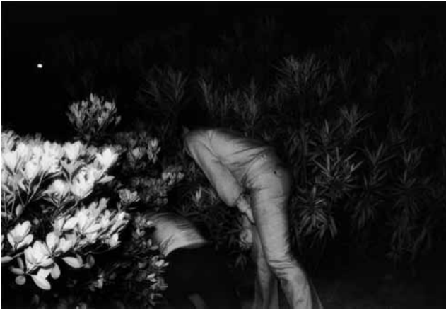
Untitled 1971, 1973, 1971 from the series The Park