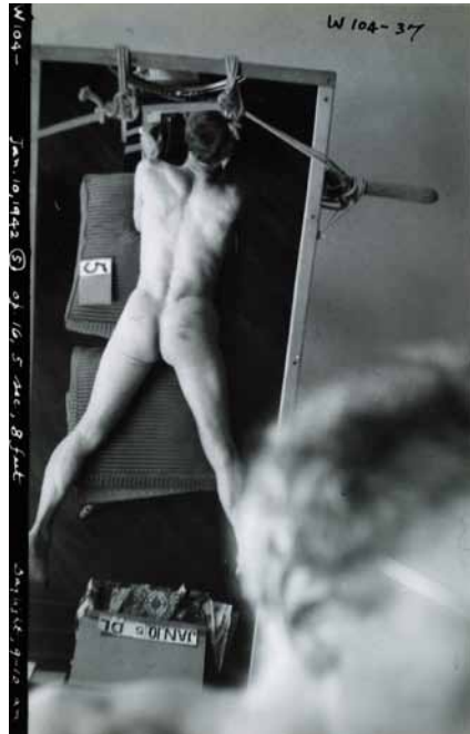
from Photo-skills Guide 1941–1942