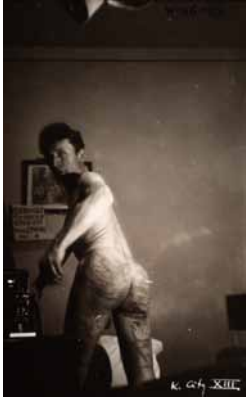
Kansas City VIII 1933