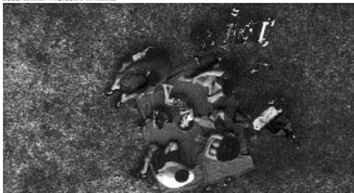
Image: Narelle Autio, 'Untitled 2001' from the series 'Not Of This Earth' (detail) Finalist in the 3rd Leica/CCP Documentary Photography Exhibition+Award

REGISTRATIONS DUE TUESDAY 1 APRIL 2003 OPENING THURSDAY 19 JUNE 2003, 6-8PM EXHIBITION DATES 20 JUNE - 19 JULY 2003