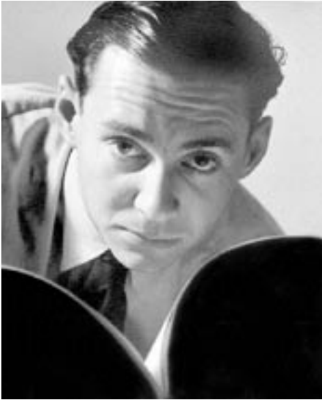
A young Max Dupain.